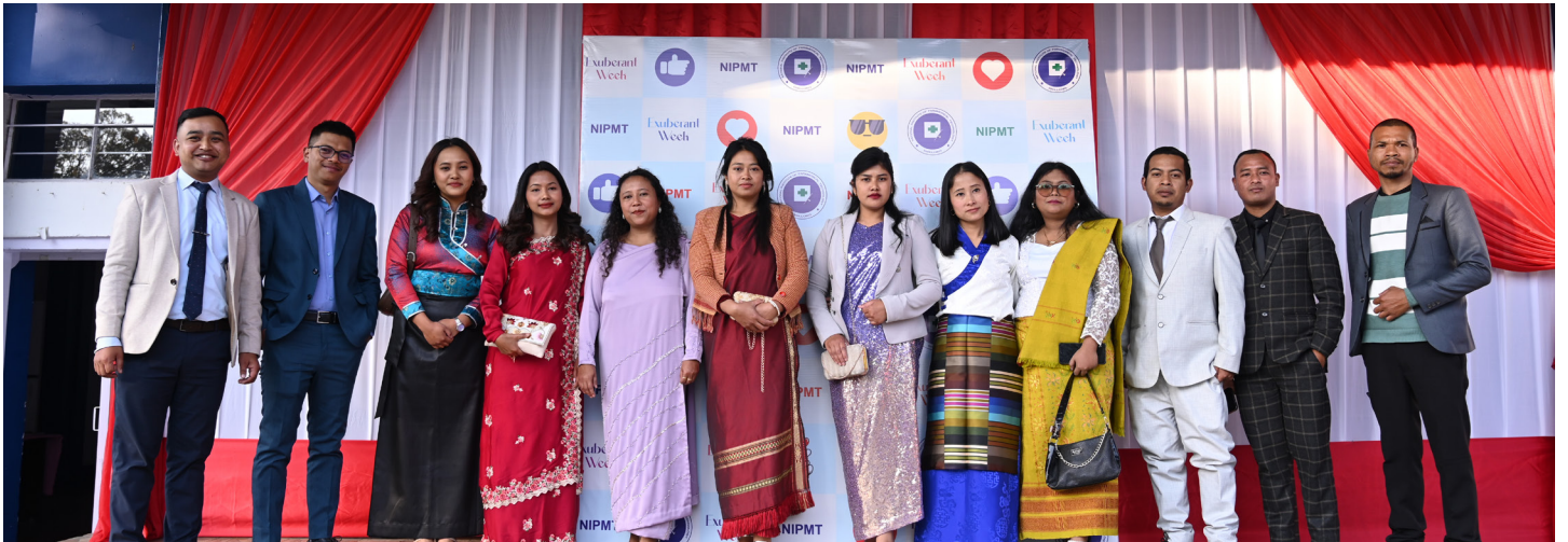
EXUBERANT WEEK 2025