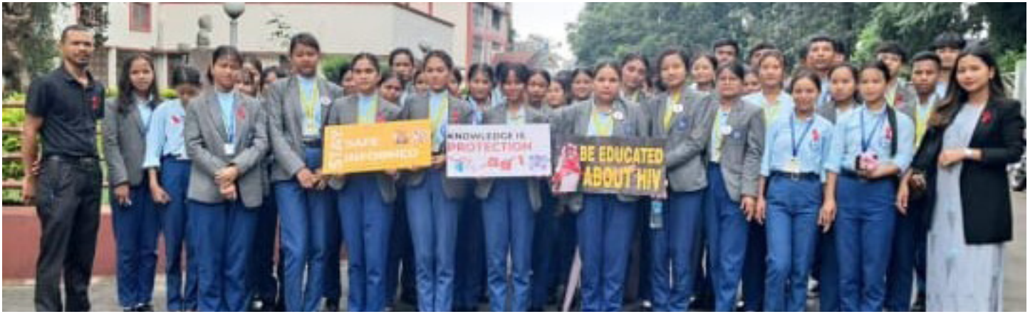
HIV-AIDS CAMPAIGN 2025