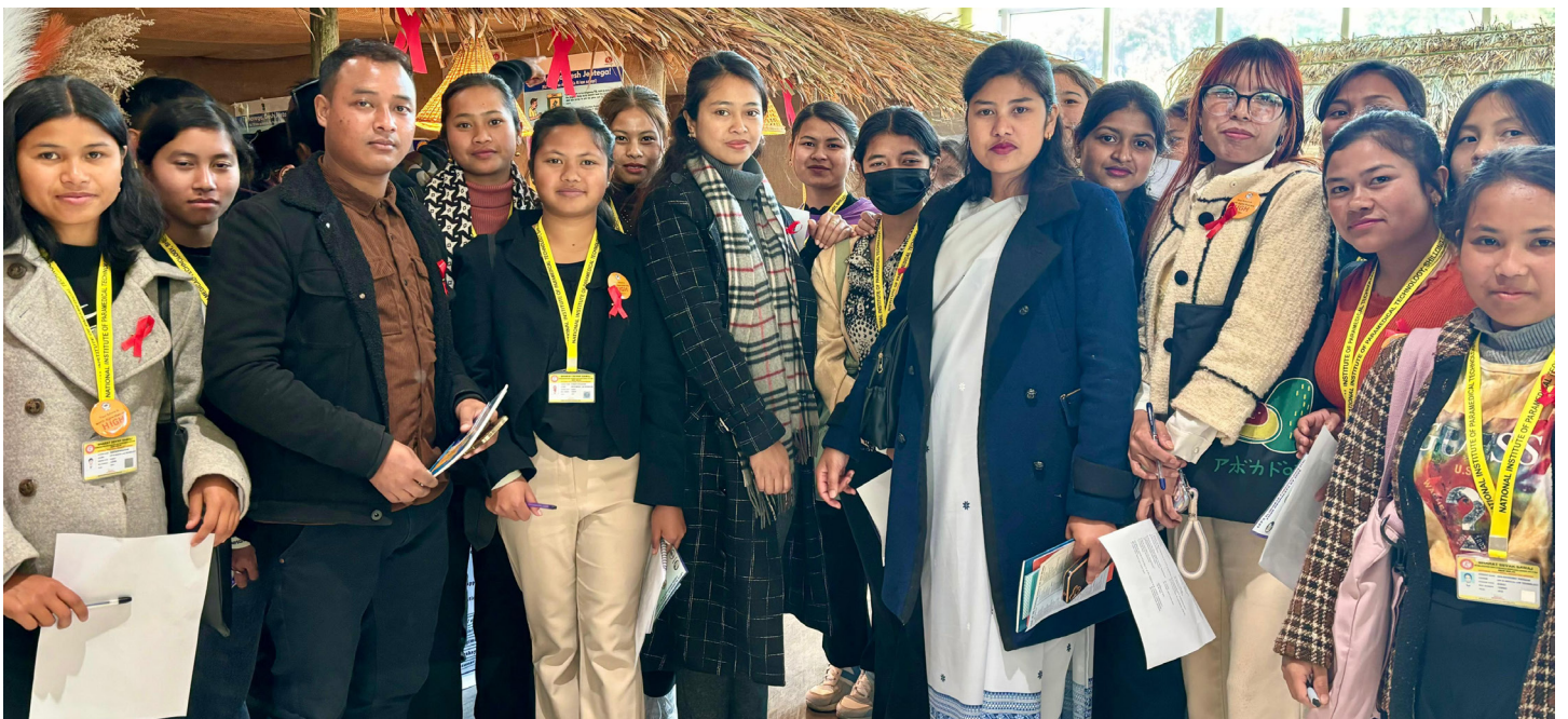
"RED FEST" - THE NORTHEAST MULTI-MEDIA CAMPAIGN 2024