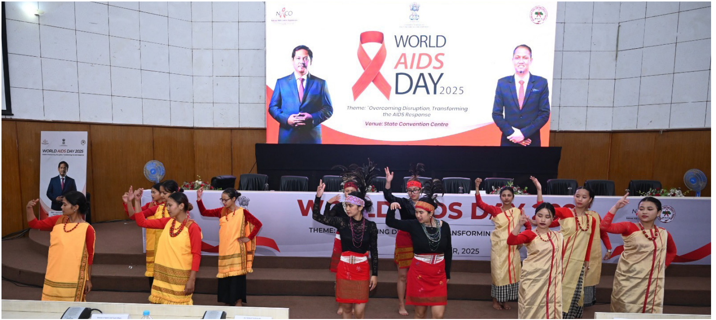
STUDENTS PERFORMING CULTURAL DANCE ON WORLD AIDS DAY 2025