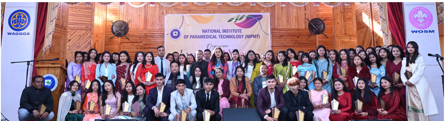
STUDENTS' FAREWELL - 23RD BATCH 2025